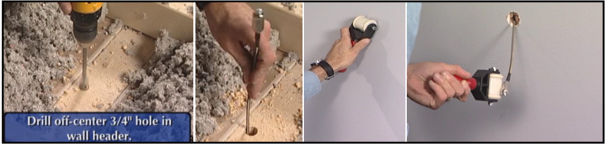
Drill off-center 3/4" hole in wall header.