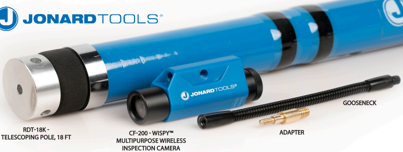
RDT-18K - TELESCOPING POLE, 18 FT