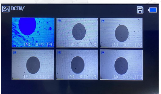
Save images and videos